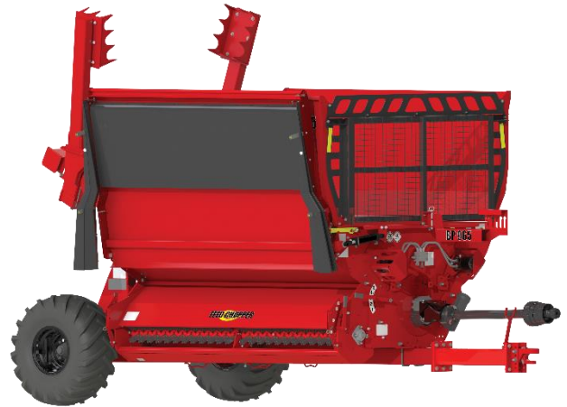
*Feed Chopper™ equipped model shown