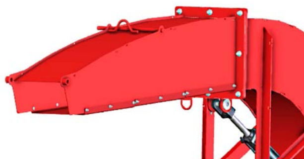
Fasten the Chute to the Elbow