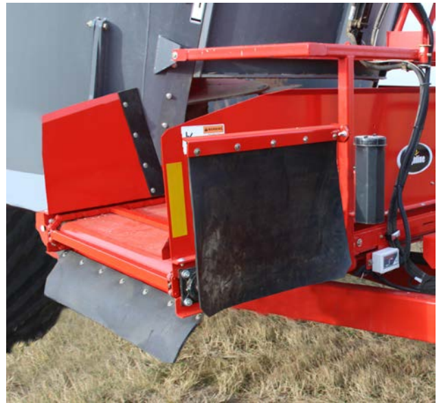
Attached Right Mud Flap