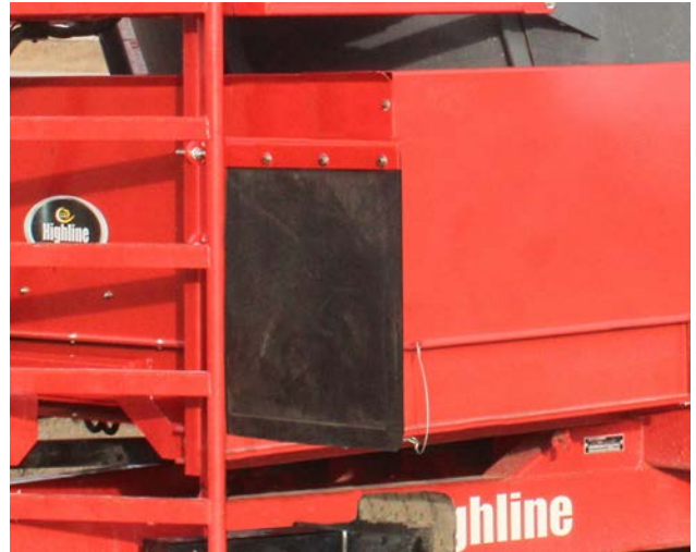
Attached Left Mud Flap