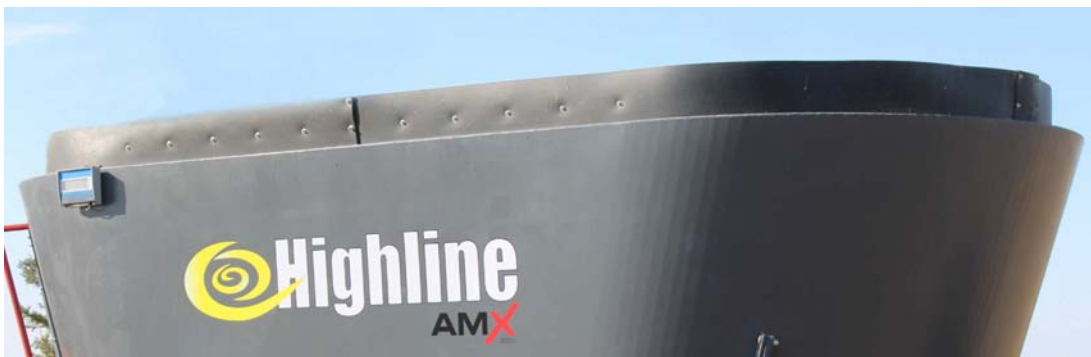
Installed Tub Extension